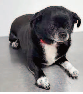
Patrick is a 5 year old male Chihuahua mix

Available for adoption at PAWS 517 SE 3rd St.