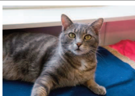
Cache is a 1 year old female Domestic Shorthair mix

Available for adoption at PAWS 517 SE 3rd St.