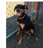
Hope is a 3 year old female Doberman Pinscher mix

Available for adoption at PAWS 517 SE 3rd St.