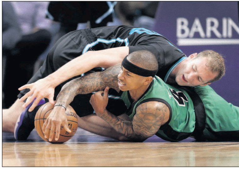
Charlotte Hornets' Cody Zeller, top, and Boston Celtics' Isaiah Thomas, bottom, vie for a loose ball in the second half of an NBA basketball game in Charlotte, N.C., Saturday, April 8, 2017. The Celtics won 121-114.