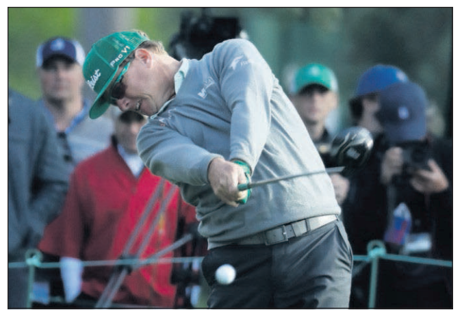
Charley Hoffman hits a drive on the 18th hole during the first round of the Masters golf tournament Thursday, April 6, 2017, in Augusta, Ga.

Jack Burke Jr. had a four-shot lead in 1955. Lee Westwood, who has the credentials as the best player to have never won a major, ran off five straight birdies late in the afternoon and salvaged a 70. Only eight other players broke par, a group that included Phil Mickelson, Justin Rose and Sergio Garcia. The average score was 74.98, the highest for an opening round since 2007.