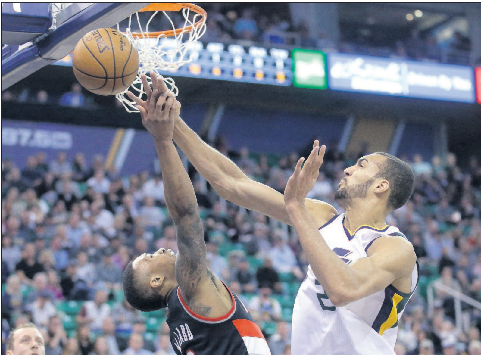
Utah Jazz center Rudy Gobert (27) blocks the shot by Portland Trail Blazers guard Damian Lillard, left, during the first half in an NBA basketball game Tuesday, April 4, 2017, in Salt Lake City.