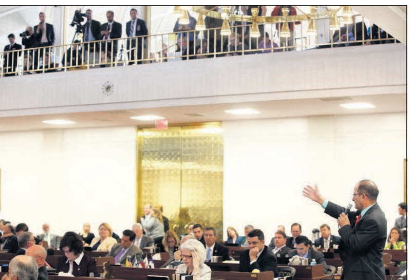
Rep. Michael Speciale, R- Craven, debates on the floor of the the North Carolina State House prior to a vote on HB 142 on Thursday, March 30 in Raleigh, N.C.

Because the state had no anti-discrimination law before then, HB2 created a new statewide policy prohibiting discrimination based on race, religion, color, national origin or biological sex — while leaving lesbians, gays, bisexuals and transgender people unprotected — in "public accommodations," which include restaurants, hotels and