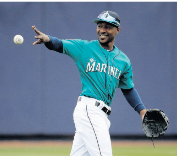
In this Monday, Feb. 27, 2017, photo, Seattle Mariners center fielder Jarrod Dyson throws the ball during the first inning of a spring training baseball game against the Kansas City Royals in Peoria, Ariz.