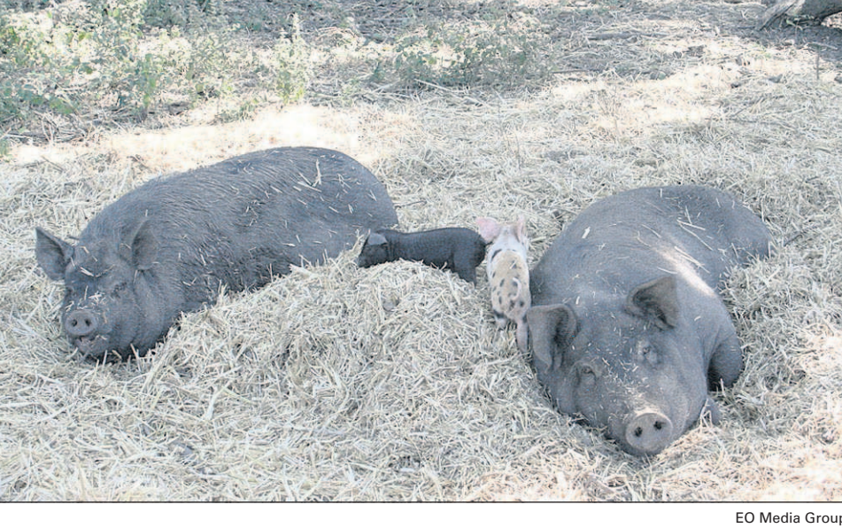
Pigs relax outdoors in this file photo. Oregon lawmakers are contemplating a bill barring discrimination against pigs or any particular species of livestock.

Species-specific stock restrictions seem to run counter to the philosophy of Oregon's "right to farm" law, which disallows local restrictions against