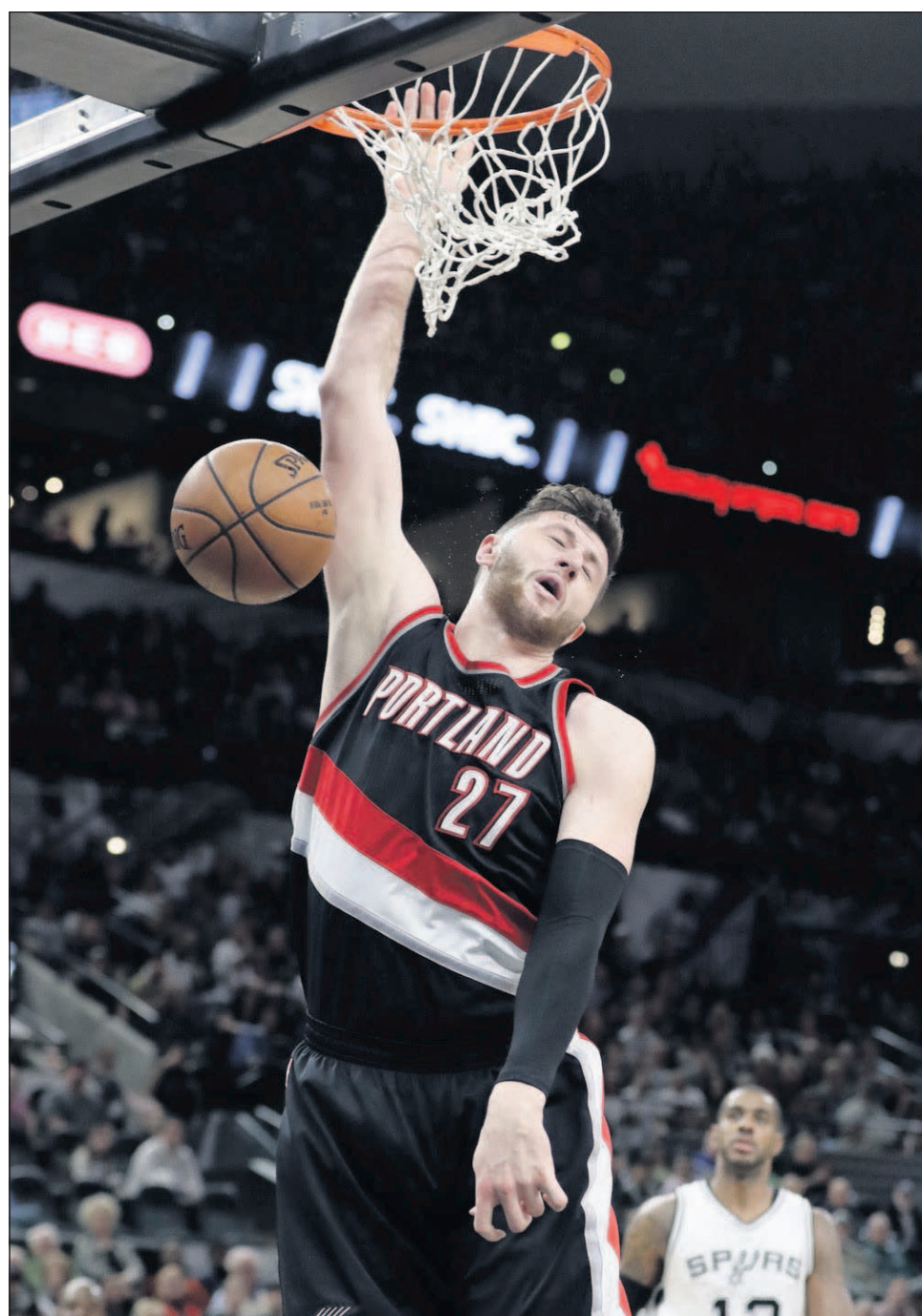
Portland Trail Blazers center Jusuf Nurkic (27) dunks against the San Antonio Spurs during the second half of Wednesday's game in San Antonio.