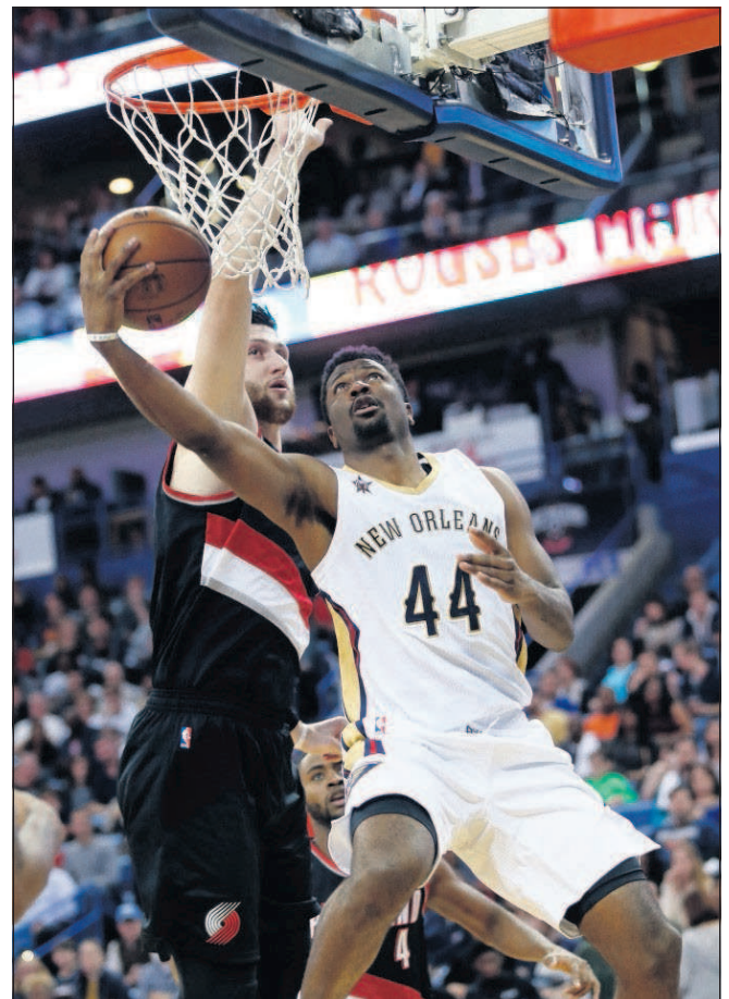
New Orleans Pelicans forward Solomon Hill (44) goes to the basket in front of Portland Trail Blazers center Jusuf Nurkic in the first half of an NBA basketball game in New Orleans, Tuesday, March 14, 2017.

Blazers: Portland plays the middle game of a five-game road trip when it visits San Antonio on Wednesday.