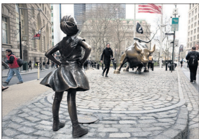
A statue titled "Fearless Girl" faces the Wall Street bull, Wednesday in New York.

Twenty-five percent of the Russell 3000 — a broad index of U.S. companies — have no women on their boards, according to State