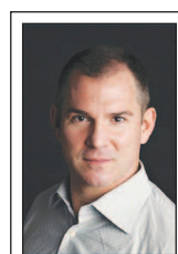
FRANK BRUNI Comment

One of the biggest security threats the world faced in recent years was Ebola — and the next pandemic may be much worse — and the only effective response was to work with