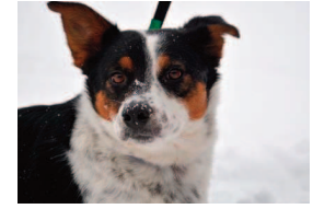
Max is a 1.5 year old male American Blue Heeler/ Australian Shepherd

Available for adoption at PAWS 517 SE 3rd St.