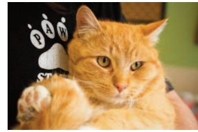
Donald is a 2 year old male Domestic Shorthair Mix

Available for adoption at PAWS 517 SE 3rd St.