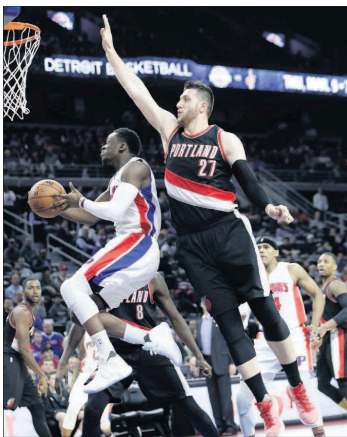
Detroit Pistons guard Reggie Jackson, left, makes a layup defended by Portland Trail Blazers center Jusuf Nurkic (27) during the first half of an NBA basketball game, Tuesday, Feb. 28, 2017, in Auburn Hills, Mich.