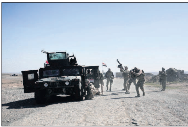
Iraqi police forces fire shots at Islamic State militant positions from a hillside outside the town of Abu Saif, Monday.

between the U.S. and Iraq. "I imagine we'll be in this fight for a while and we'll stand by each other," Mattis said.