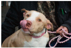
Luna is a 1.5 year old female Retriever, Lab/ Terrier, American Pit Bull

Available for adoption at PAWS 517 SE 3rd St.