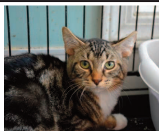
Lars is an 8 month old male Domestic Shorthair mix

Available for adoption at PAWS 517 SE 3rd St.