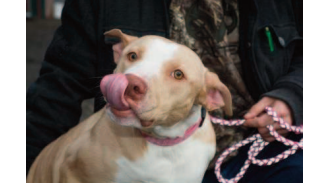
Luna is a 1.5 year old female Retriever, Lab/ Terrier, American Pit Bull

Available for adoption at PAWS 517 SE 3rd St.