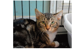
Lars is an 8 month old male Domestic Shorthair mix

Available for adoption at PAWS 517 SE 3rd St.