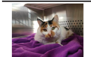
Cora is a 4 year old female Domestic Shorthair mix

Available for adoption at PAWS 517 SE 3rd St.