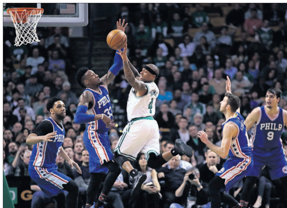
Boston Celtics guard Isaiah Thomas (4) passes the ball as he is covered by the Philadelphia 76ers during the second half of an NBA basketball game in Boston, Wednesday, Feb. 15, 2017. The Celtics defeated the 76ers 116-108.

All-Star Media Day was Friday in New Orleans, and LeBron James and Carmelo Anthony both missed the Eastern Conference session for personal reasons. Their absences likely drove a few more people over toward the riser where Thomas took questions for a half-hour or so, though he seemed genuinely