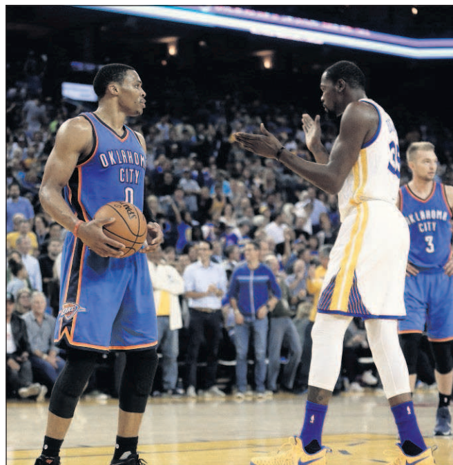
In this Nov. 3, 2016, file photo, Golden State Warriors' Kevin Durant, right, celebrates in front of Oklahoma City Thunder guard Russell Westbrook (0) during the first half of an NBA basketball game, in Oakland, Calif.