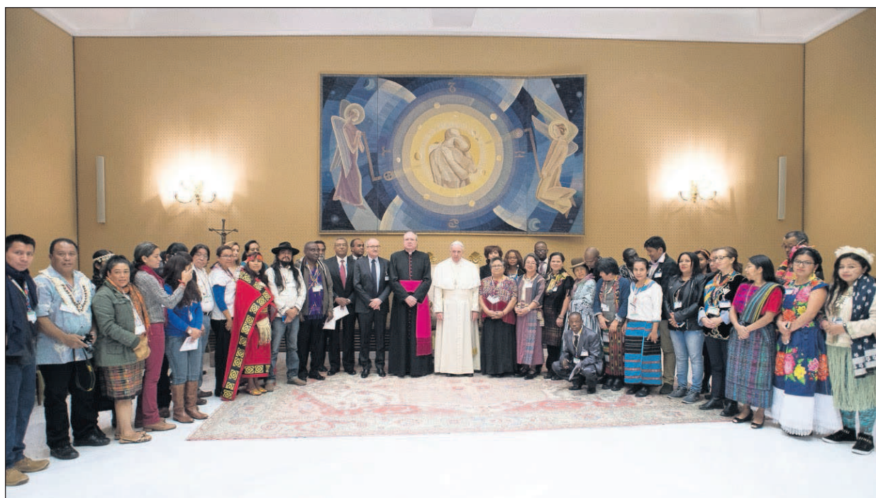
Pope Francis, center, poses with representatives of indigenous peoples attending a UN agricultural meeting in Rome, at the Vatican, Wednesday.