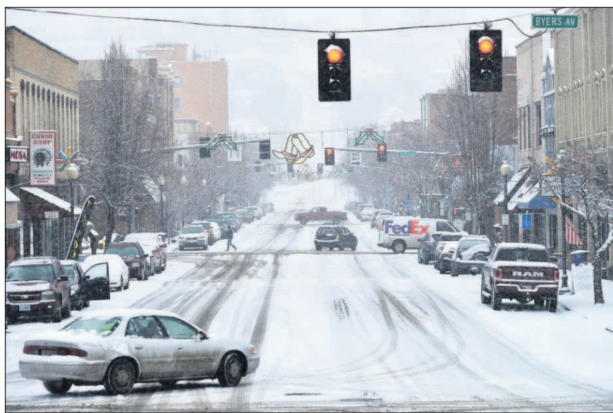
Snowy conditions return to Main Street in Pendleton as a cold front pushed through the region Tuesday. The Pendleton School Board voted Tuesday to add five days to the end of the school year to make up for the seven days the district canceled due to inclement weather.