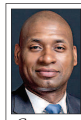
CHARLES BLOW Comment

But perhaps one of the best reasons Trump and Spicer need to bone up on Douglass is to understand his relationship with Abraham Lincoln and to get a better sense of what true leadership looks like.