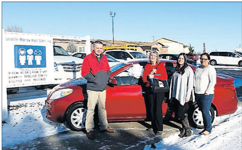
The Healthy Families program of Umatilla Morrow Head Start Inc. received a Wildhorse Foundation grant, which was used to purchase a vehicle to provide home visits.

While walk-ins are welcome, people are encouraged to make an appointment via 800-448-3543 or www.redcross-blood.org/give.