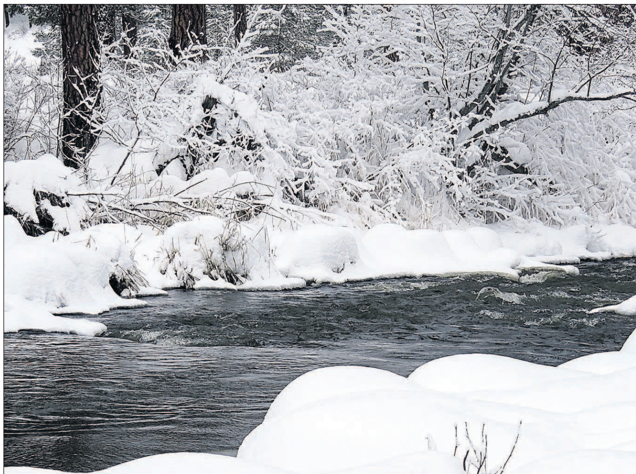
A creek is surrounded by snow-covered rocks and brush in the Blue Mountains.