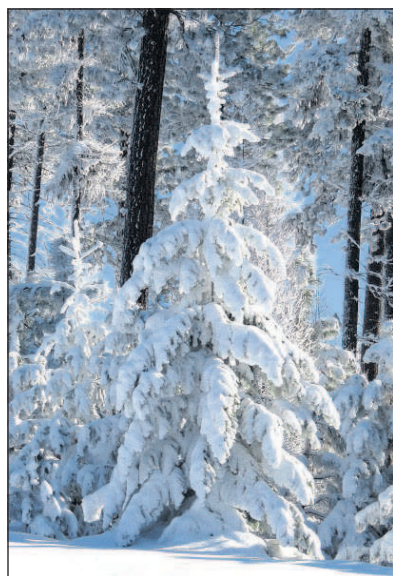
Evergreen trees are blanketed in snow near Battle Mountain.