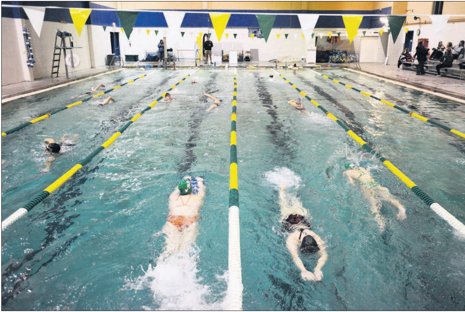
Members of the Pendleton swim team do warm-ups during practice on Thursday at BMCC in Pendleton.