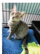
PEACHES is a 6 month old female Domestic Shorthair

Available for adoption at PAWS 517 SE 3rd St.