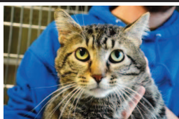
JB is a 3 year old male Domestic Shorthair

Available for adoption at PAWS 517 SE 3rd St.