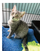
PEACHES is a 6 month old female Domestic Shorthair

Available for adoption at PAWS 517 SE 3rd St.