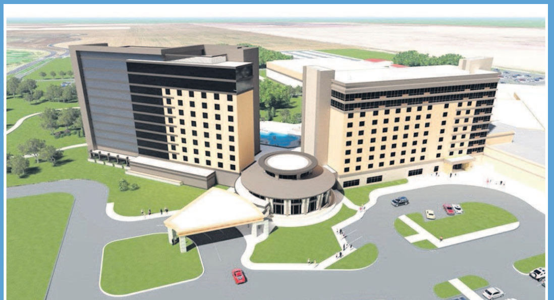
A second hotel tower will rise from the Wildhorse Resort & Casino in the future. The expansion will also include a 32-lane bowling alley, horse arena and new concert venue, among other improvements.