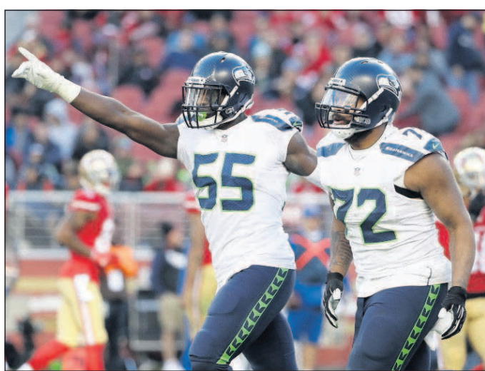
Seattle Seahawks defensive end Michael Bennett (72) celebrates with defensive end Frank Clark after sacking San Francisco 49ers quarterback Colin Kaepernick during the second half of an NFL football game in Santa Clara, Calif., Sunday, Jan. 1, 2017.