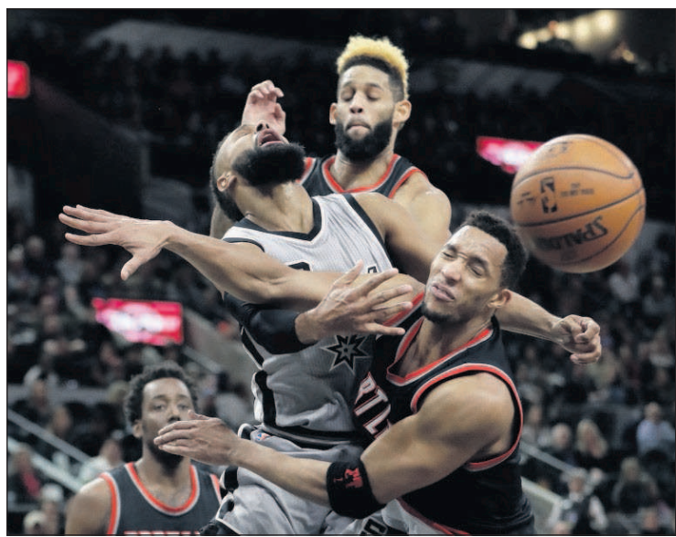
San Antonio Spurs guard Patty Mills, center, is defended by Portland Trail Blazers’ Evan Turner, front, and Allen Crabbe, rear, during the second half of an NBA basketball game, Friday, in San Antonio. San Antonio won 110-94.

“We’ve got to do a better job of coming out with more of an edge to the game,” said Spurs center Pau Gasol, who finished with 10 points and seven rebounds. “Teams know we’ve been having the slow starts and they play with confidence. Then