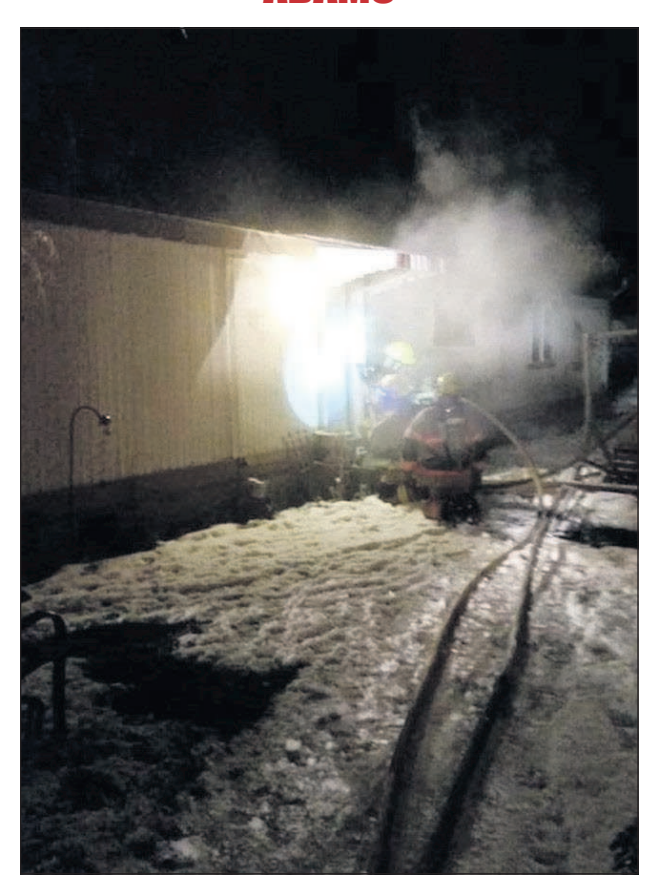
to contributed by the East Umatilla County Rural Fire Protection District Firefighters work to extinguish a fire at a manufactured home late Monday, Dec. 26.