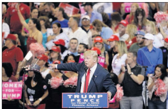
In this Oct. 29, 2016 photo, Republican presidential candidate Donald Trump speaks at a campaign rally in Phoenix.

But in recent days, points of tension between their two teams have started to emerge, driven by Trump's picks of Cabinet nominees who have vowed to dismantle much of what Obama has accomplished. The Obama administration has also been dismayed by requests from Trump's team for information they fear could be used to try to identify and then eliminate bureaucrats who have worked on Obama priorities like climate change and women's rights overseas.