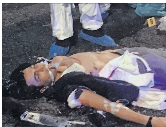
Anis Amri, a 24-year-old Tunisian, was shot dead early Friday by police conducting a routine stop in Milan after he opened fire on them.

in the Sesto San Giovanni neighborhood of Milan. He pulled a gun from his backpack after being asked to show his ID and was killed in an ensuing shootout.