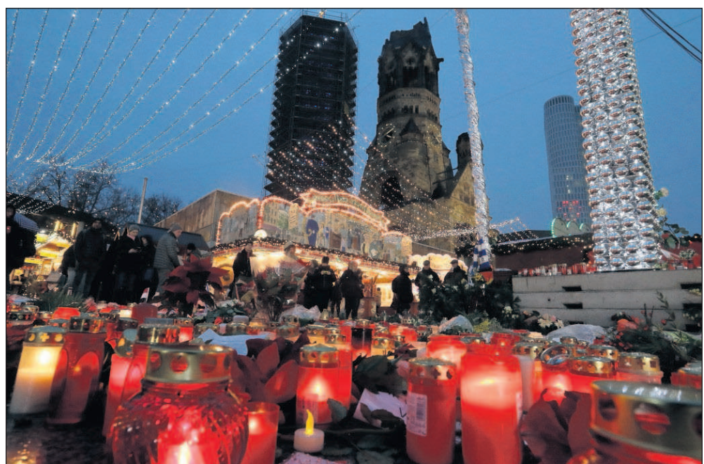
People walk past candles and flowers after the reopening of the Christmas market at the Kaiser Wilhelm Memorial Church in Berlin, Germany, Thursday, three days after a truck ran into the crowded market killing 12 people and injuring 56 others.

Amri, who had spent time in prison in Italy, was confronted by the officers