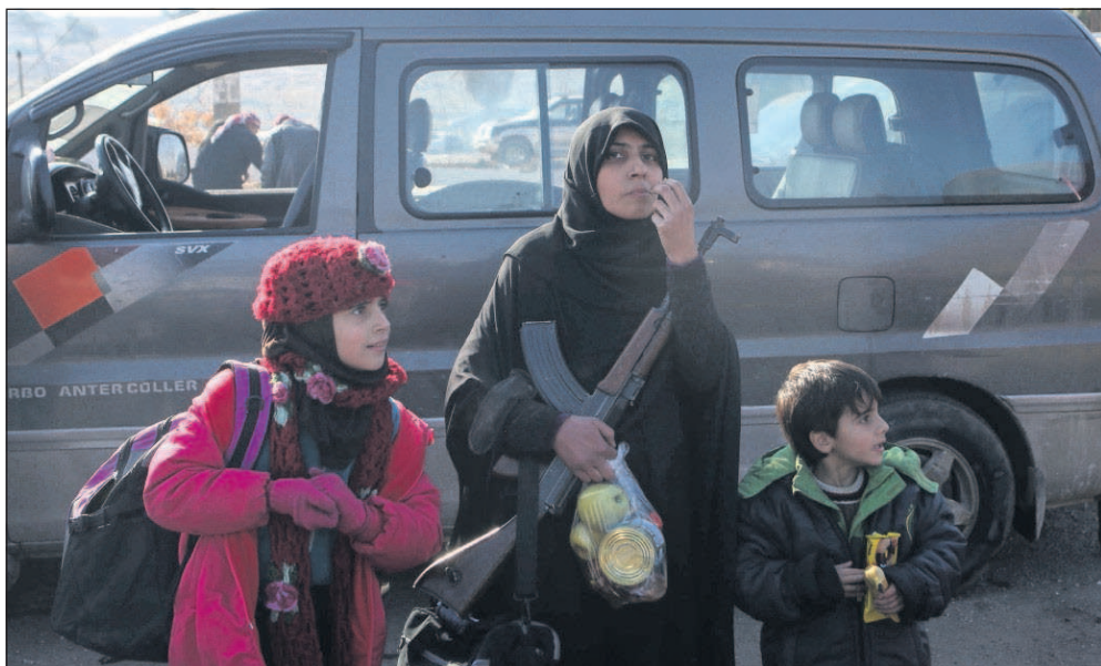
Syrians evacuated from the embattled Syrian city of Aleppo during the ceasefire arrive at a refugee camp in Rashidin, near Idlib, Syria, Tuesday.

buses wearing thick jackets and carrying sacks with belongings. One woman dressed in a black robe and face veil carried a small child swaddled in a heavy yellow blanket. A man held a toddler whose face was peeking out from under a blanket shielding him from falling snow.