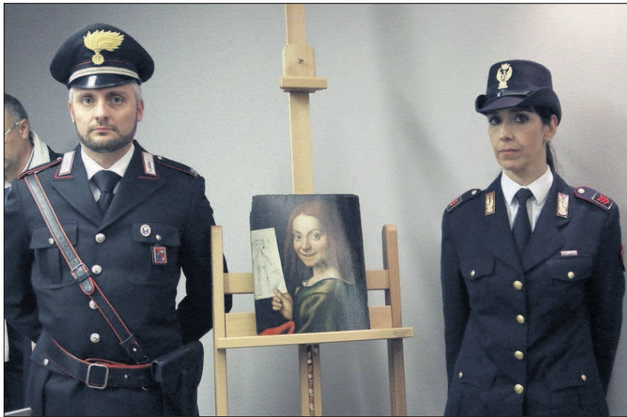
Carabinieri and police officers pose with one of the recovered paintings that were stolen from a Verona museum, at the Verona airport, Italy, Wednesday. Italy's culture minister traveled to Kiev to recover 17 paintings, including works by Tintoretto, Rubens and Mantegna, that were stolen from a Verona museum and recovered by Ukrainian law enforcement more than seven months ago.