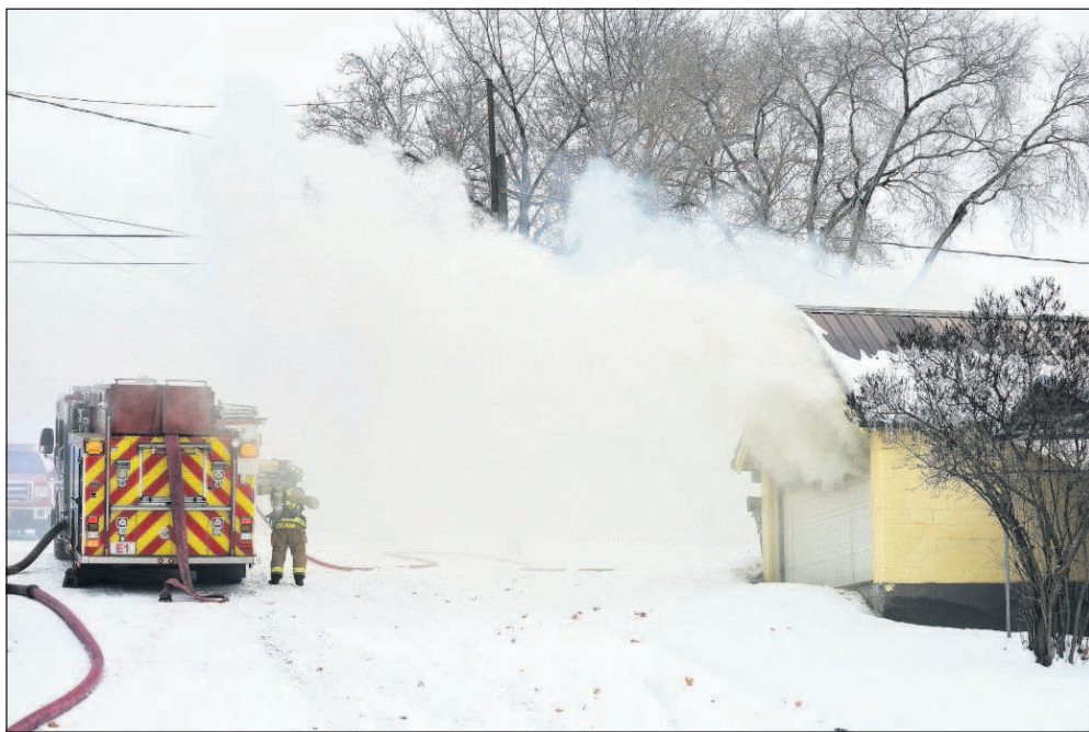
Smoke billows out of the garage of a residence as Pendleton firefighters prepare to fight the fire at 1106 N.W. Ellis on Monday in Pendleton.

A furnace that was on appears to be the cause of the fire, he said, but whether