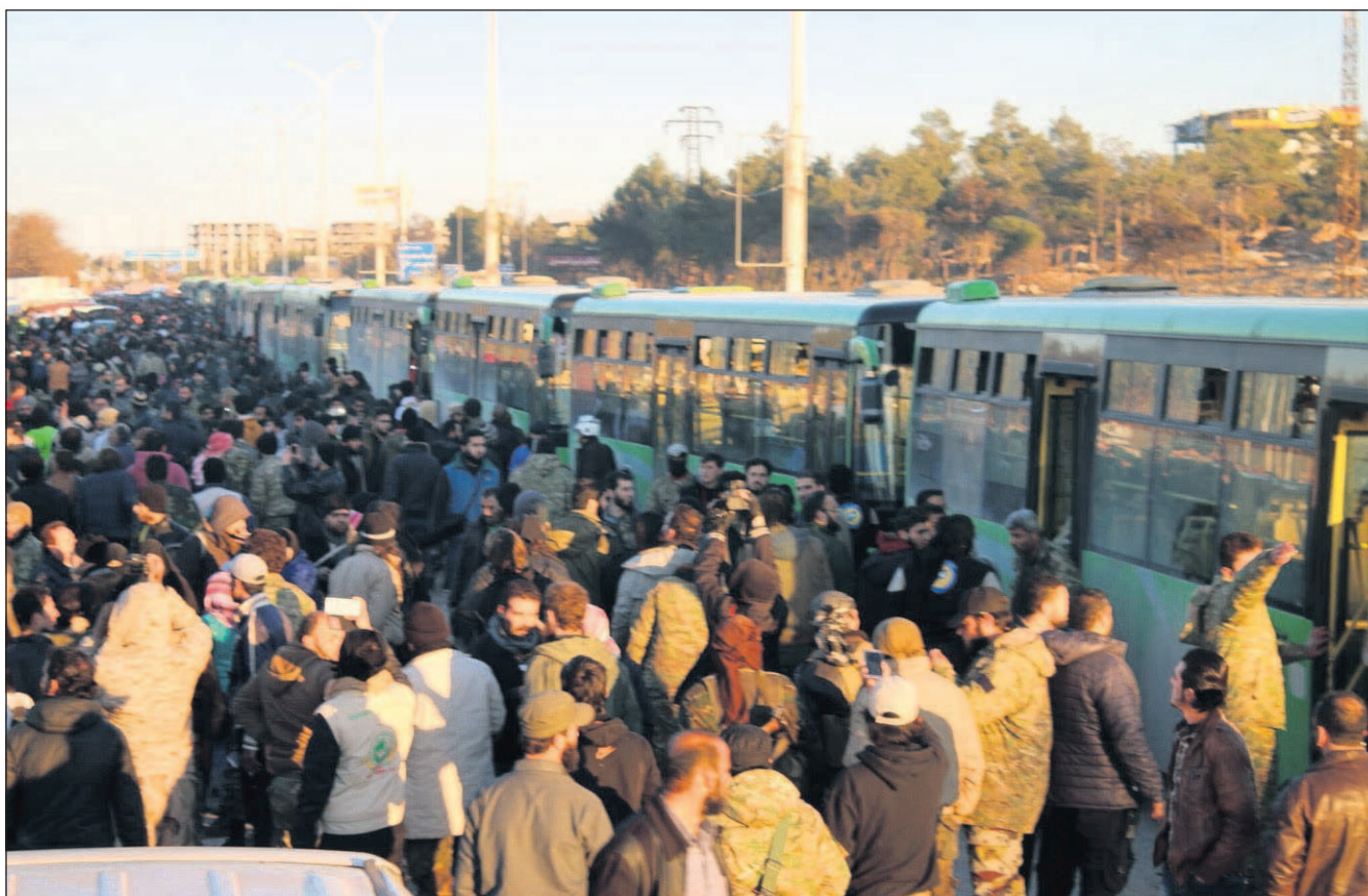
Residents gather near green government buses for evacuation from eastern Aleppo, Syria. The evacuation of eastern Aleppo stalled Friday after an eruption of gunfire, as the Syrian government and rebels threw accusations at each other, raising fears that a peaceful surrender of the opposition enclave could fall apart with thousands of people believed to be still inside.

The cease-fire and evacuation marked the end of the rebels' most important stronghold in the 5-year-old civil war. The suspension demonstrated the fragility of the cease-fire deal, in