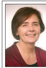
GAIL COLLINS Comment

After his big public dinner date with Trump, Romney bumbled to reporters that they had a "discussion about affairs throughout the world, and these discussions I've had with him have been enlightening and interesting and engaging. I've enjoyed them very, very