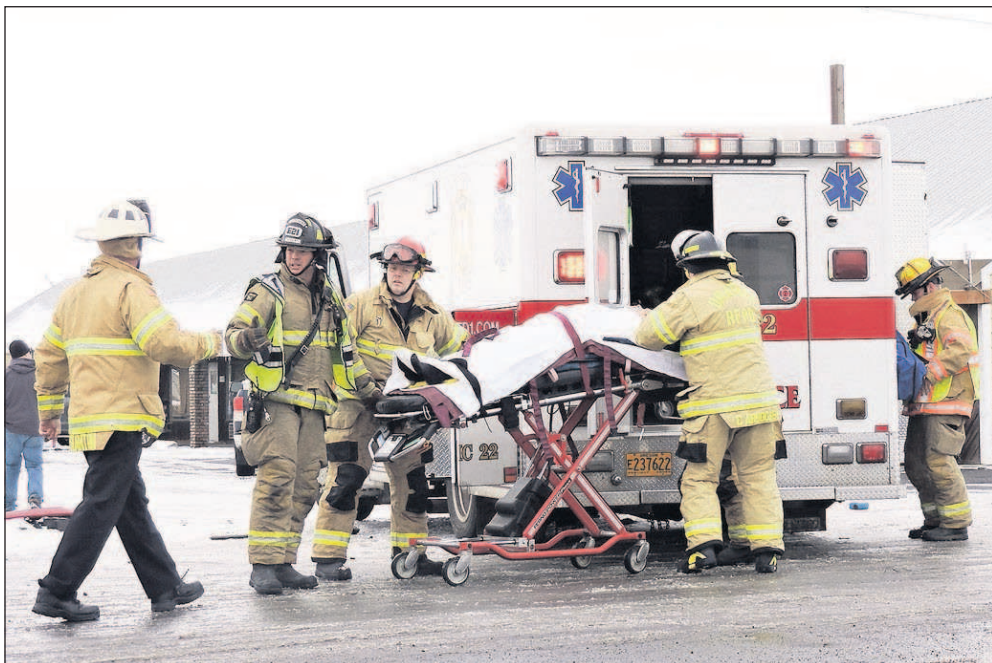
Umatilla County Fire District 1 responders load an injured person into an ambulance Tuesday after a two-vehicle wreck on Highway 395 north of Hermiston. Three people were injured in the crash.

The Brownings were taken by ambulance to the same hospital and then flown by Life Flight to Kadlec Medical Center with life-threatening injuries.