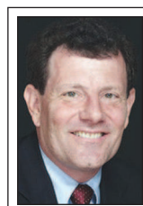
NICHOLAS KRISTOF Comment

So, sure, Democrats sometimes go overboard with identity and can do a far better