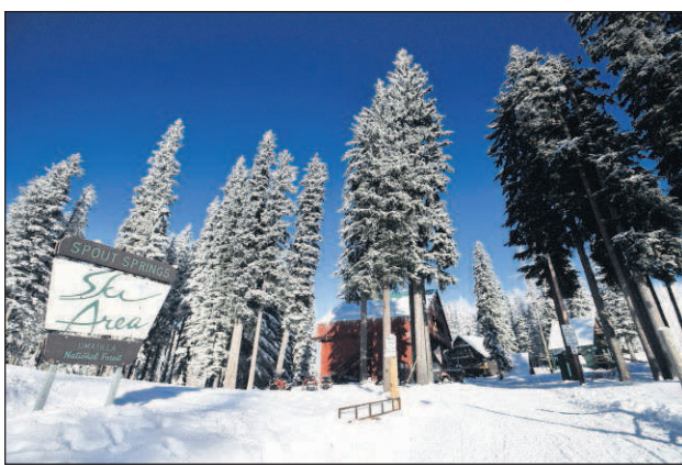
The Spout Sprint Ski Area will not open this year due to concerns about public safety in the parking lot.