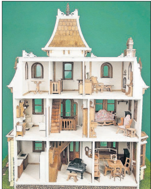
A raffle will be held for a Greenleaf Beacon Hill Doll House built by Eastern Oregon Correctional Institution. Proceeds will benefit the Children's Museum of Eastern Oregon.

of Eastern Oregon began in 1996 with a mission to provide kids of all ages with opportunities for educational exploration and development