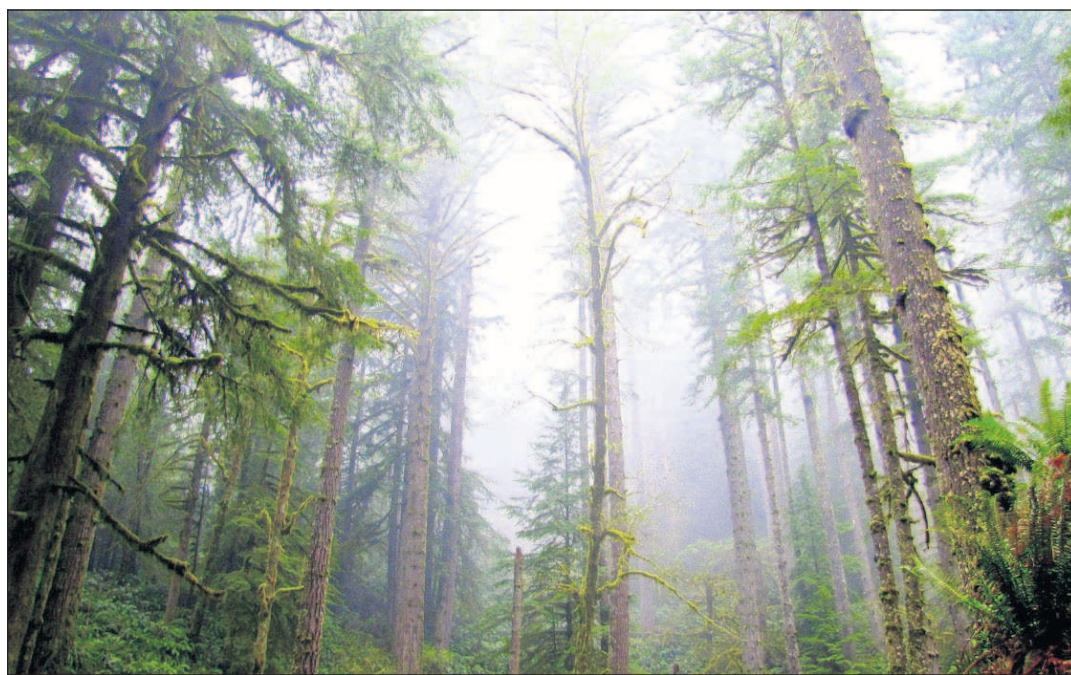
Fires in the Elliott State Forest. The Oregon Department of State Lands said in a report Tuesday that if the sale of the Elliott State Forest is to go through, there are some details that need to be ironed out about how key conditions of the sale will be enforced.

According to an announcement from Lone Rock detailing the proposal last month, the Confederated Tribes of Coos, Lower Umpqua and Siuslaw Indians would hold a conservation easement for the public access, maintenance of old stands and the riparian areas requirements, which are supposed to remain in perpetuity.