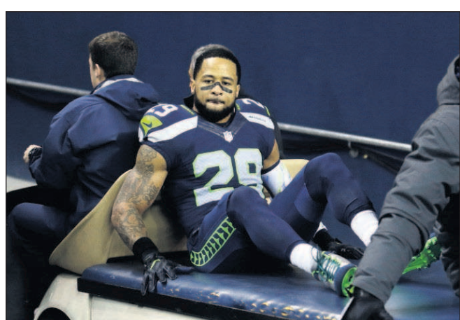
Seattle Seahawks' Earl Thomas leaves the field on a cart after being injured against the Carolina Panthers in the first half of Sunday's game in Seattle.