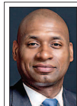
CHARLES BLOW Comment

"It did. Kellyanne, it did," said Palmieri. Yes Kellyanne, that is exactly what you did and no amount of personal outrage about being called out on it is going to rewrite that history. Furthermore, everyone who sees you should say that to your face at every