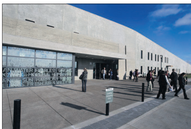
In this 2015 photo, visitors to the Oregon State Hospital Junction City campus walk outside the facility during a public tour in Junction City.