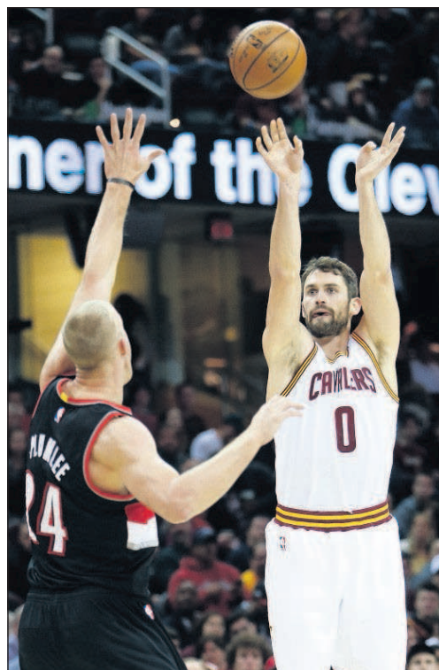
Cleveland Cavaliers' Kevin Love (0) shoots over Portland Trail Blazers' Mason Plumlee (24) during the first half of an NBA basketball game, Wednesday, Nov. 23, 2016, in Cleveland.