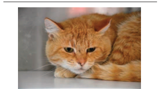
TIBBS is a 5 year old male Domestic Shorthair mix

Available for adoption at PAWS 517 SE 3rd St.