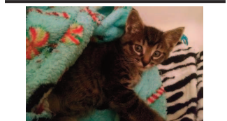
SERAN is a 2 month old female Domestic Shorthair mix

Available for adoption at PAWS 517 SE 3rd St.