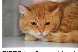
TIBBS is a 5 year old male Domestic Shorthair mix

Available for adoption at PAWS 517 SE 3rd St.