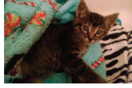
SERAN is a 2 month old female Domestic Shorthair mix

Available for adoption at PAWS 517 SE 3rd St.