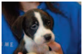
AARON is a 1 month old male Vizsla Mix

Available for adoption at PAWS 517 SE 3rd St.