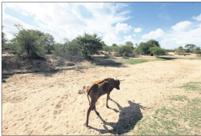
In this file photo taken Sunday, a malnourished cow walks along a dried-up river bed in the village of Chivi, Zimbabwe.

assessment for 2016 is set to be released next week.