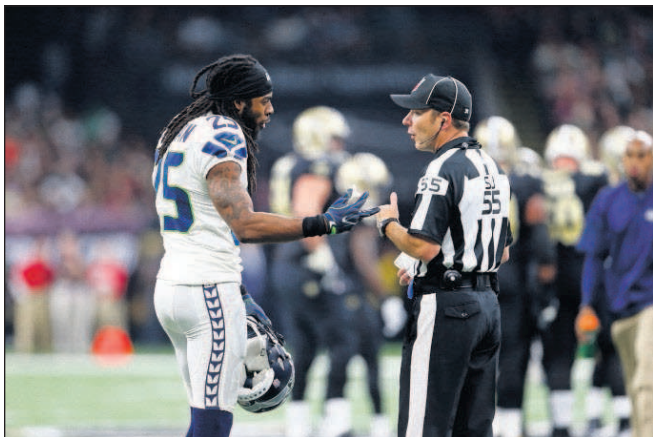
In this Oct. 30, 2016, file photo, Seattle Seahawks cornerback Richard Sherman (25) talks to an official in the first half of an NFL football game against the New Orleans Saints in New Orleans.

NFL says it is 'absolutely going to address' situation