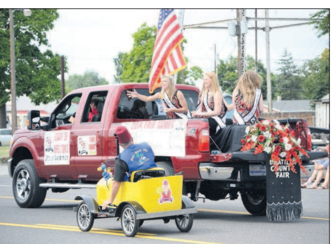
Members of the 2014 Umatilla County Fair court throw candy during Stanfield's annual Fourth of July parade. Applications are being accepted for the 2017 fair court.

PENDLETON — A special class that features information on how to make lower-calorie, yet tasty, food options will be offered at the Pendleton Public Library.