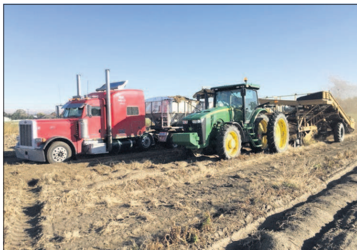
A crew harvests potatoes on October 19 at HAREC to donate to a local food bank.