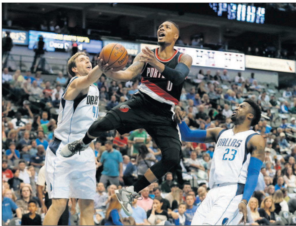
Portland Trail Blazers guard Damian Lillard (0) goes up for a shot after getting past Dallas Mavericks' Dirk Nowitzki and Wesley Matthews (23) during the first half of an NBA basketball game, Friday, Nov. 4, 2016, in Dallas.

"Sensational. Amazing. All-Star. MVP," McCollum said of Lillard's